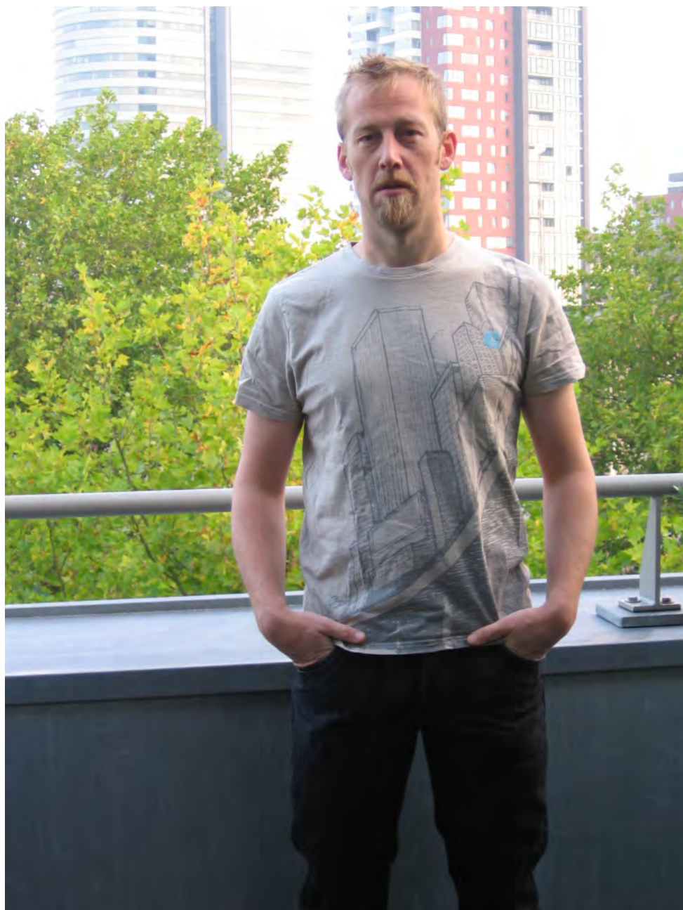
Dressed as if nothing is wrong.