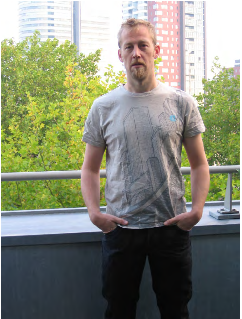
Rotterdam (in the background) is a city which in fact never should have been able to exist as a city. It's 12 meter below sea-level and it isn't supposed to be accessible to sea-ships.